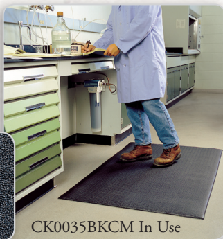
CK0035BKCM In Use