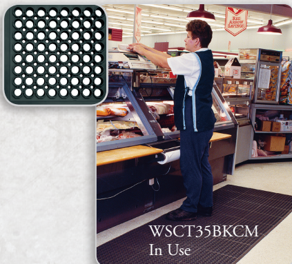
WSCT35BKCM In Use